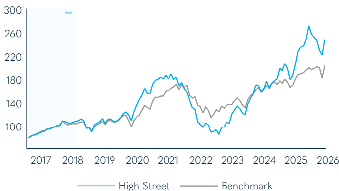
Benchmark: Morningstar EAA Fund Global Large-Cap Growth Equity category Source: Bloomberg, 30/04/2026