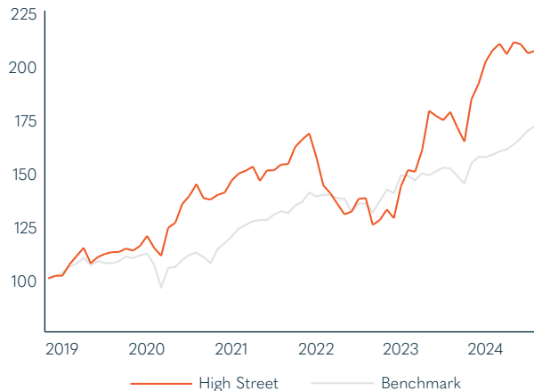
Benchmark: Category peer average (South Africa - Multi Asset - High Equity) Source: High Street Asset Management, 31/08/2024