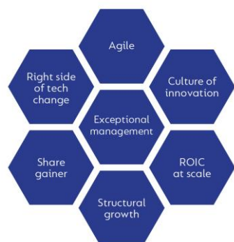
Figure 1 BUILDING BLOCKS OF A WINNING BUSINESS

A natural question following a period of strong performance is how we position the Fund from here? The winning businesses framework we introduced last year (Figure 1) remains a useful lens. In a dynamic and fast-changing world, we think owning winning businesses – when priced attractively – stacks the odds of outperforming over the long-term in your favour.