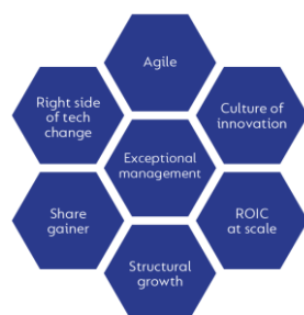
Figure 1 BUILDING BLOCKS OF A WINNING BUSINESS

A natural question following a period of strong performance is how we position the Fund from here? The winning businesses framework we introduced last year (Figure 1) remains a useful lens. In a dynamic and fast-changing world, we think owning winning businesses – when priced attractively – stacks the odds of outperforming over the long-term in your favour.