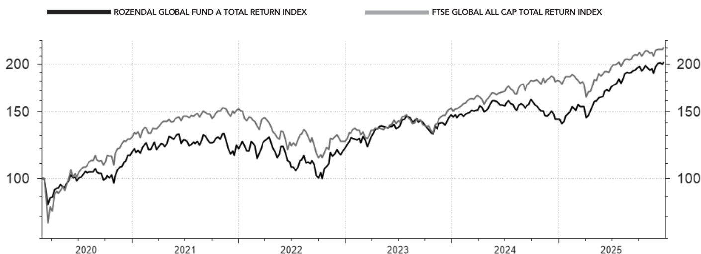
RELATIVE RETURN VS. BENCHMARK (REBASED TO 100)