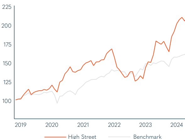
Benchmark: Category peer average (South Africa - Multi Asset - High Equity) Source: High Street Asset Management, 31/05/2024