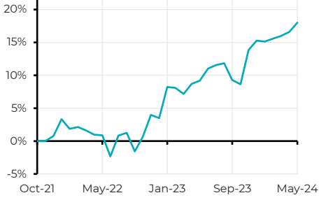
CUMULATIVE PERFORMANCE (%)