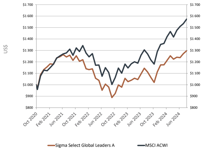
Illustration showing growth of $ 1000 investment at date of inception 1